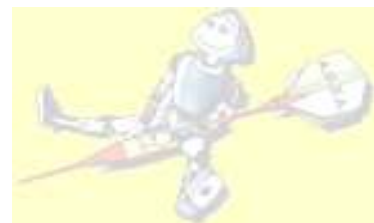
CUADRANTE Nº1 MARTES